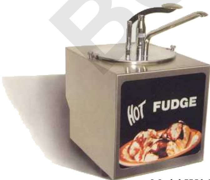
Model H50-P (Warmer w/Pump)

Compact in design, these units save valuable counter space. The lighted panel along with colorful graphics will surely put focus on your merchandise and stimulate sales.