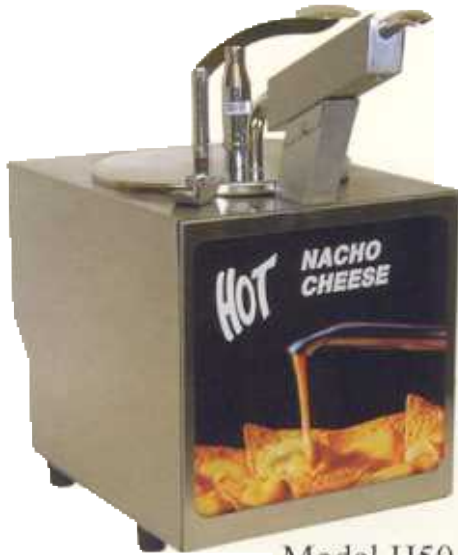
Model H50-HS (Warmer w/Heated Spout)

Each unit comes complete with an on-off switch, a lighted panel, attractive graphics, and 6 ft. cord and plug for easy installation. Powered by a powerful 400 watt wrap around heating element, it provides evenly distributed heat to the entire unit. Cecilware's Hot Condiment Dispensers are an exceptional value for your everyday foodservice operation.