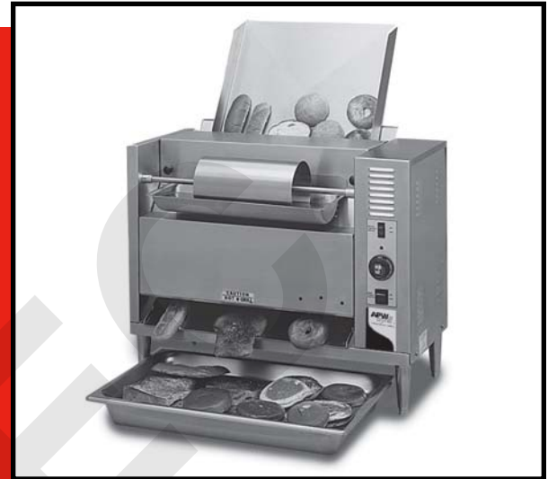
MODEL M-83 BUN GRILL TOASTER