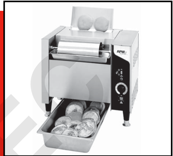
MODEL M-2000 BUN GRILL TOASTER