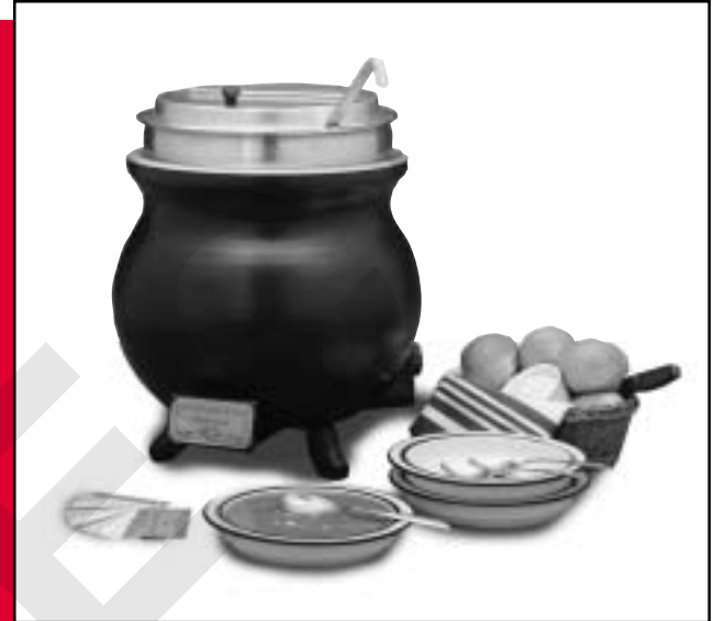
COUNTERTOP ROUND KETTLE SERVERS