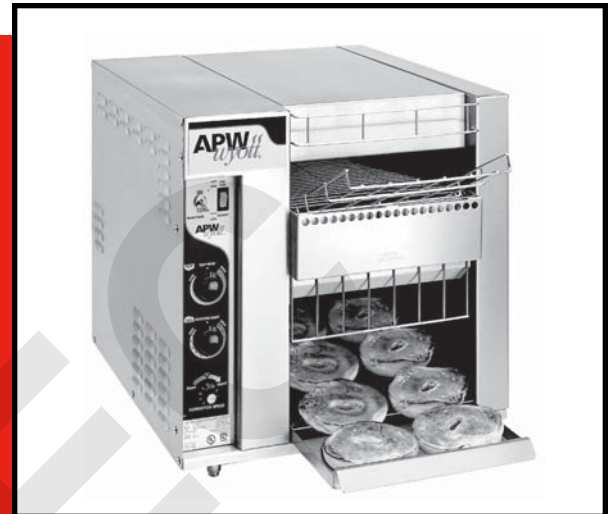
MODEL BT-15-2 CONVEYOR TOASTER